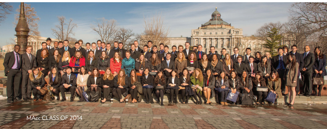
MAcc CLASS OF 2014

2014 awards will be announced in March 2015.