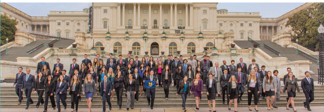
MAcc CLASS OF 2015

The 2015 awards will be announced in March 2016.